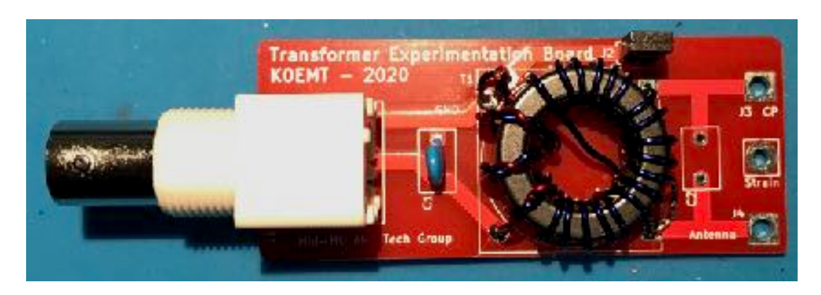
18-AWG enamel coated wire was used.